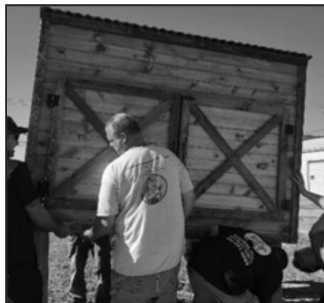
Volunteers helping with the Community Garden

New York Times: Database filled with every New York Times article as well as videos, recipes, and even lesson plans.